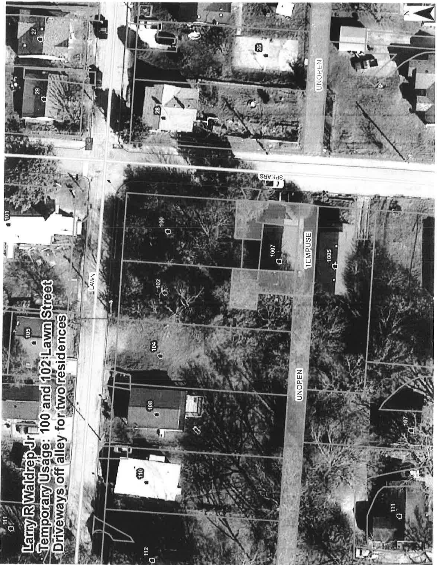
Larry R Waldrep Jr Temporary Usage: 100 and 102 Lawn Street Driveways off alley for two residences